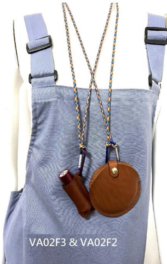
VA02F3 & VA02F2